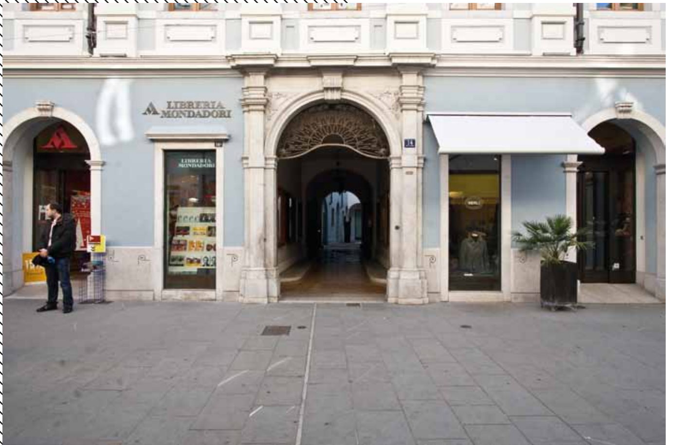
Entrance via Cavana 14, Triest