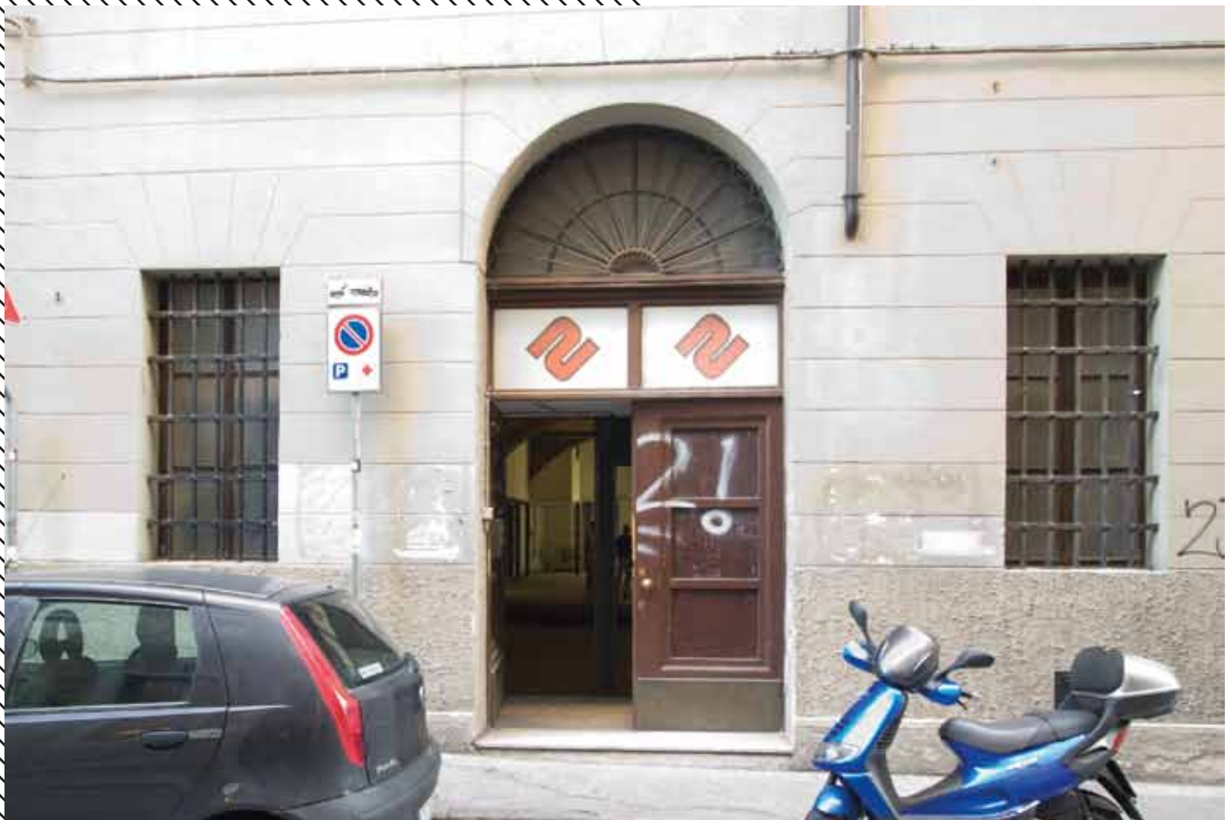
Entrance, Via Madonna del Mare 3a, Trieste