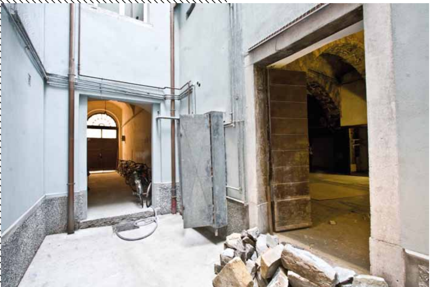
Inside court, Via Madonna del Mare 3a, Trieste