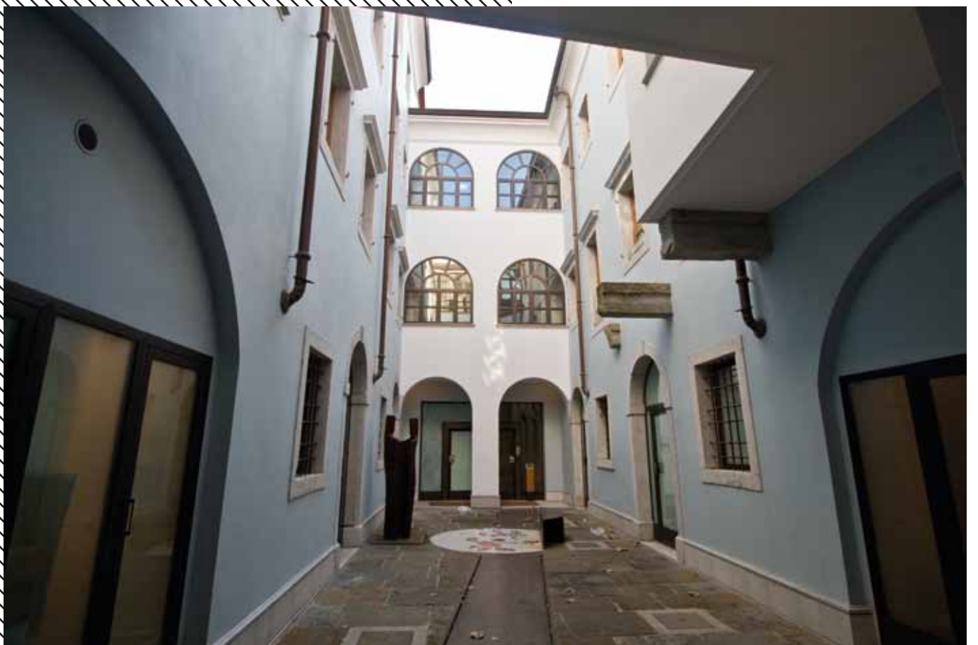
Entrance, Inside court, via Cavana 14, Triest